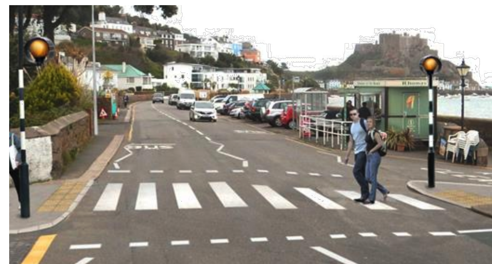
Zebra Crossing Traffic Calming + Crossing Features